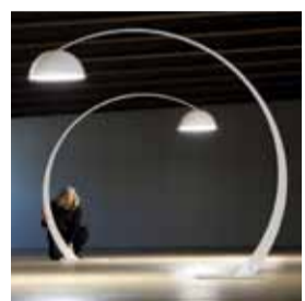
1962 by F. Zavarise