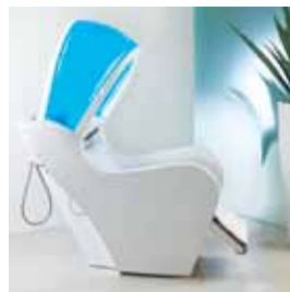
Kromo Wash by G. Maletti