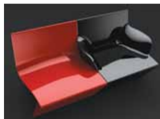
Kami Ichi by M. Sadler

Mob. +971 50 658 1641 - www.desertriver.com